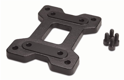
IronHorse Worm Gearbox Mounting Base