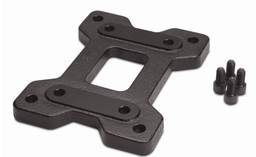
IronHorse Worm Gearbox Mounting Base