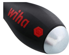
Metal Striking Cap