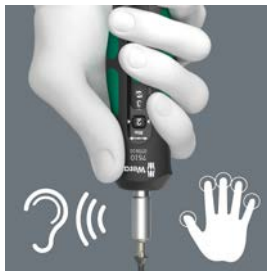
Excess Load Signal