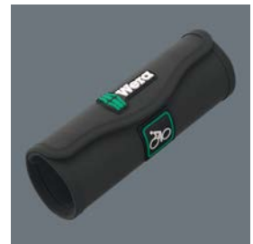
Storage and Transport