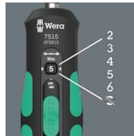
5 Selectable Torque Values