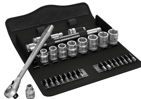
Wera socket set with Zyklop Metal switch lever ratchet, 3/8 inch drive, metric, 29 pieces. Includes the pieces listed in the table below.