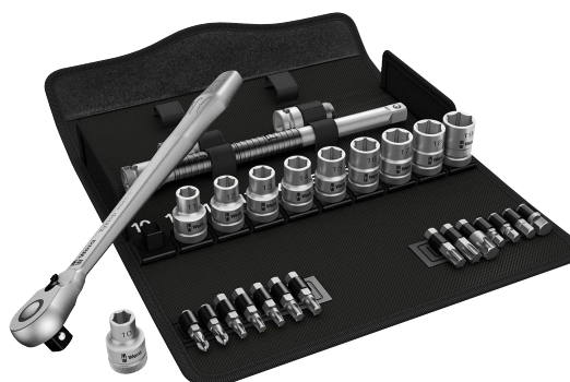
Wera socket set with Zyklop Metal switch lever ratchet, 1/2 inch drive, metric, 28 pieces. Includes the pieces listed in the table below.