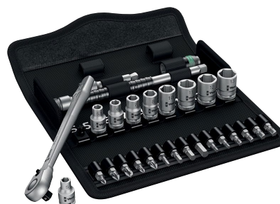
Wera socket set with Zyklop Metal switch lever ratchet, 1/4 inch drive, metric, 28 pieces. Includes the pieces listed in the table below.