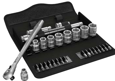
Wera socket set with Zyklop Metal switch lever ratchet, 3/8 inch drive, metric, 29 pieces. Includes the pieces listed in the table below.