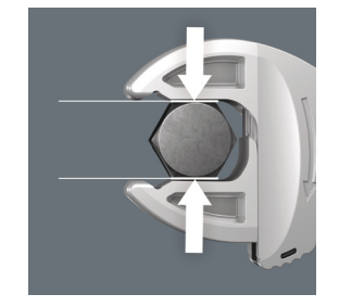
Gentle Gripping Action