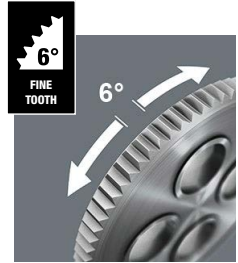
Small return angle