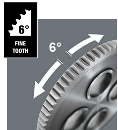
Small return angle