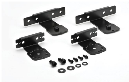
Wall Mount Bracket Part No. MD-BRK-1