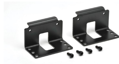
Chain Mount Brackets Part No. MD-BRK-2