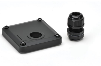
Power Back Cover w/ Cable Gland Part No. MD-PWR-COV