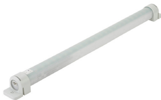
LED 022 On/off switch and magnet mount 022000-30