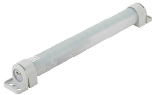
LED 021 Movement sensor and screw mount 021000-00