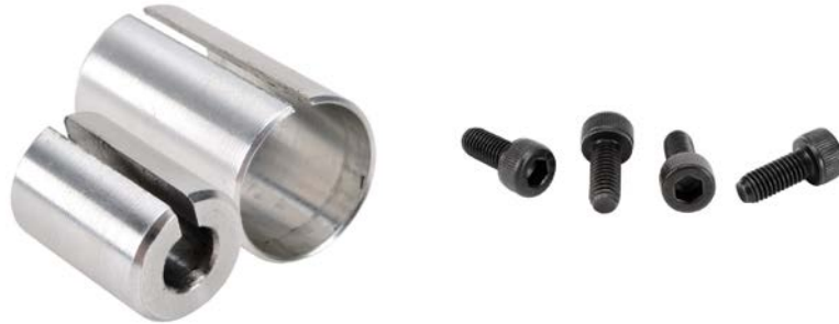
Typical PGCN Accessory Bushings Typical PGCN Accessory Screws