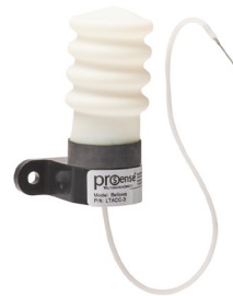
Part No. LTACC-3