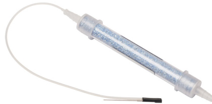
Part No. LTACC-2