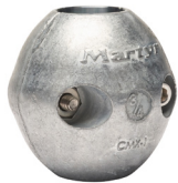
Part No. LTACC-4