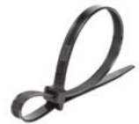
Nylon Lashing Cable Tie