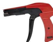
Cable Tie Gun Installation Tool