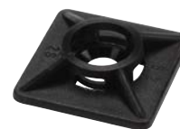
Bi-directional Nylon Square Bases