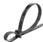
Nylon Lashing Cable Tie