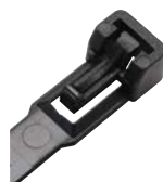
Nylon Releasable Tab