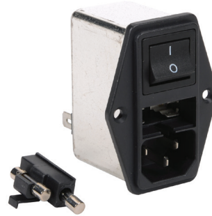
RIP Module with fuse tray removed