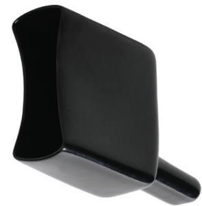
RIP/RIQ Module Protective Sleeve SLV47