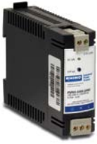
PSP05-020S PSP12-024S PSP24-024S