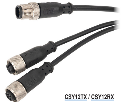
CSY12TX / CSY12RX