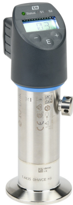
Part No. PTP33B-CA7M1FGF3CJ