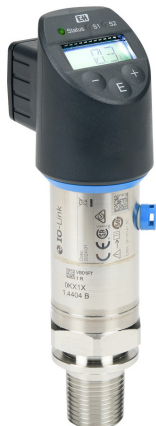
Part No. PTP31B-CA7M1FGFVXJ