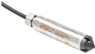
Part No. GPLT-005-L30

The ProSense GPLT and NFLT series hydrostatic submersible level transmitters provide continuous liquid level measurement by sensing the hydrostatic pressure produced by the height of liquid above the sensor and providing a 4-20 mA output signal compatible with PLCs, panel meters, data loggers, and other electronic equipment.