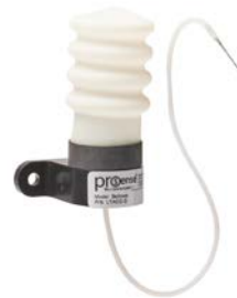
Part No. LTACC-3