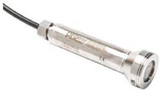
Part No. NFLT-005-L30

Available ProSense submersible level transmitter accessories include a desiccant drying tube, bellows, stabilizing weight, terminating enclosure, and protective spacer/shield for the NFLT series.