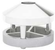
Part No. LTACC-1