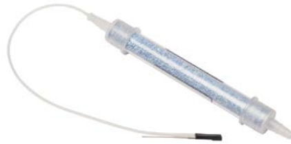
Part No. LTACC-2