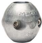
Part No. LTACC-4