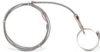
Shown with optional PCA pipe clamp adapter