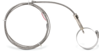
Shown with optional adjustable immersion sensor