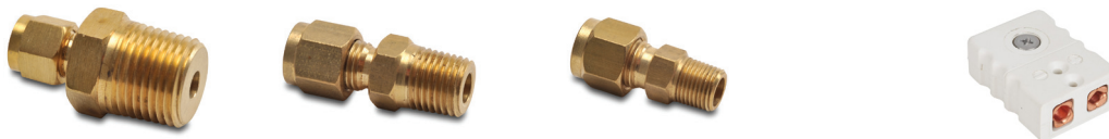
Brass Compression Fittings