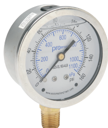
Liquid Filled Case Lower Mount