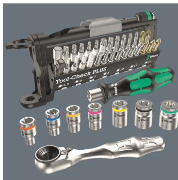
Socket and Driver Bit Set