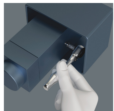
Great for Confined Spaces