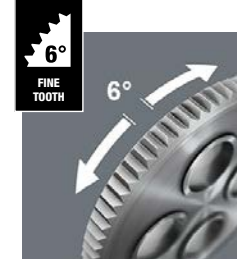
Small return angle