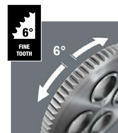
Small return angle