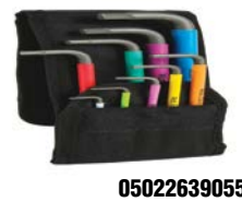
Hexagon ball tip

The spherical drive profile means that it is possible to swivel the axis of the tool to that of the screw, and therefore enable angled, "around-the-corner" screwdriving jobs.