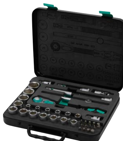
Wera driver bit and socket set with Zyklop Speed ratchet, 1/2 inch drive, metric, 37 pieces. Includes the pieces listed in the table below.