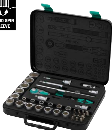
Wera driver bit and socket set with Zyklop Speed ratchet, 1/2 inch drive, SAE, 38 pieces. Includes the pieces listed in the table below.

Note: Screwdriver bits and bit-holders are warranted against manufacturer defect.