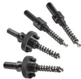
Part Numbers 106202 , 106209

Arbors include HSS pilot bit, ejector spring and 4 mm allen wrench.