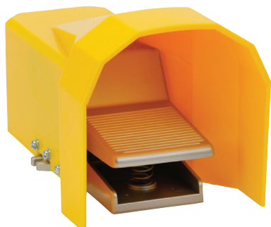
Foot Pedal Valve with Guard

NITRA™ pneumatic CVS series directional control foot pedal valves are 5-port (4-way) spool valves that are ideal for non-electrical operator control applications. Available in 1/4" NPT with a flow coefficient (Cv) of 0.80. Models are available with momentary or latching operation.