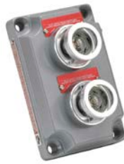
Double Pilot Light