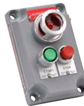
Pilot Light / Two Mini Pushbutton