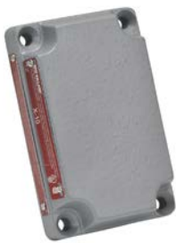
X-10 Blank Cover