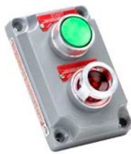
Pilot Light / Pushbutton