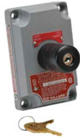
Key-Operated Selector Switch