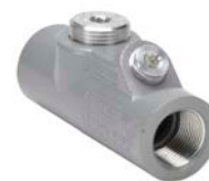
ENY-2 Sealing Fitting

The purpose of seals in a Class I hazardous location is to minimize the passage of gases and vapors and prevent the passage of flames from one electrical installation to another through the conduit system. Consult the electrical code or your local inspector for more detailed information.