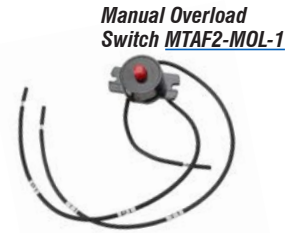
Manual Overload Switch MTAF2-MOL-1