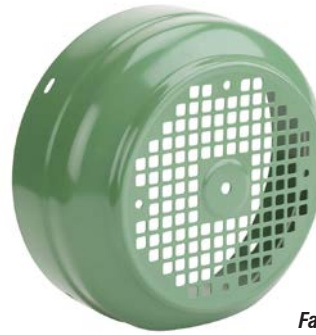
Fan Shroud MTAF2-SHROUD-180