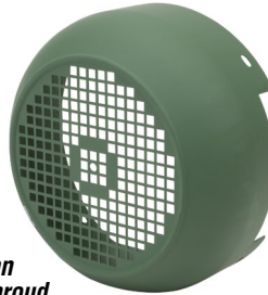
Fan Shroud MTAF-SHROUD-180