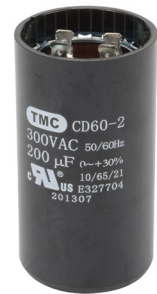
Start Capacitor MTA-CAP-16