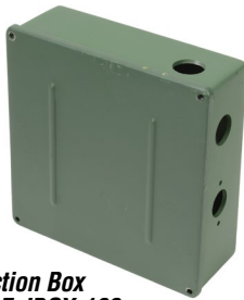
Junction Box MTAF-JBOX-180

IronHorse Farm Duty motors have a built-in manual overload switch to disable the motor if the load stops the motor (locked rotor). The overload is located in the motor's junction box, and has a manual reset switch. This switch is for locked rotor only. A separate motor thermal overload must be provided.