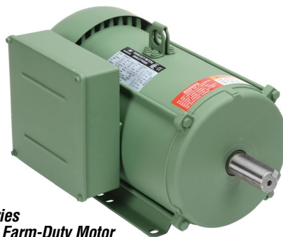
MTF Series 1-Phase Farm-Duty Motor