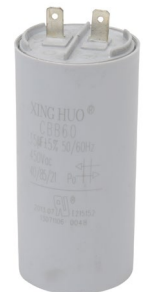
Run Capacitor MTA-CAP-19