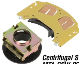
Centrifugal Switch MTA-CSW-05