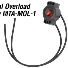
Manual Overload Switch MTA-MOL-1