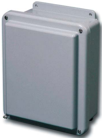
HW-J100805SC Crowned Cover Model Shown