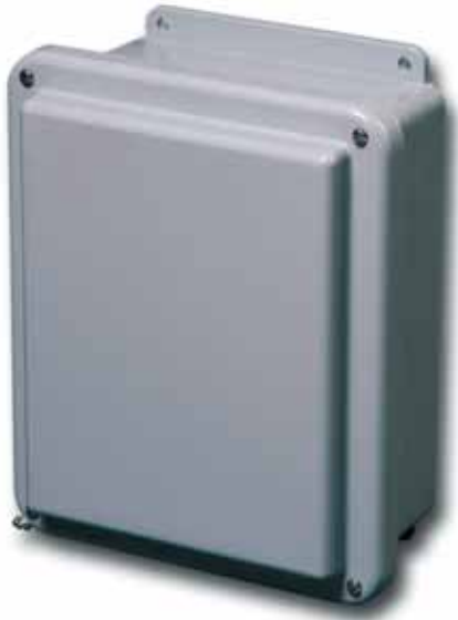
HW-J100805SC Crowned Cover Model Shown