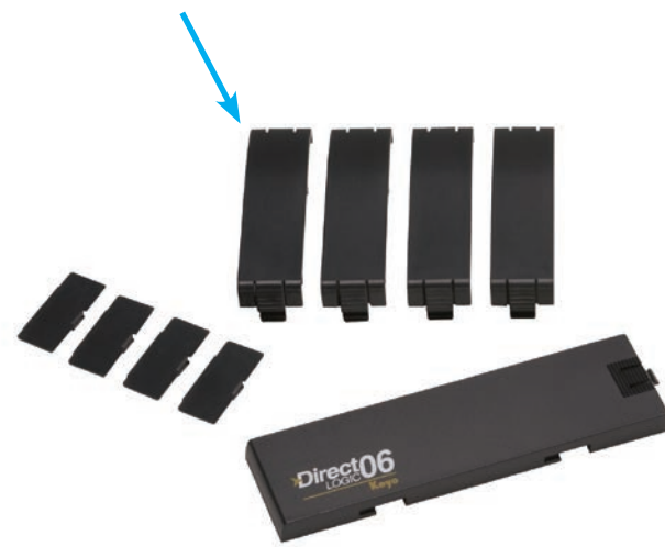
DL06 replacement terminal blocks, terminal block covers, terminal block labels and short bar D0-ACC-2