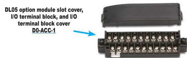
DL05 option module slot cover, I/O terminal block, and I/O terminal block cover D0-ACC-1