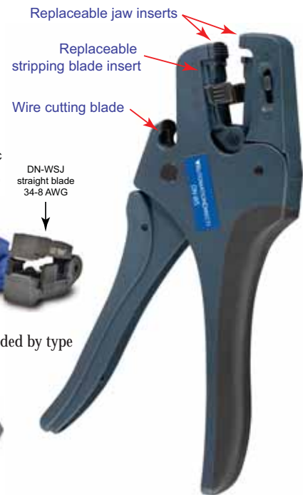
DN-WS Cutting & Stripping Tool