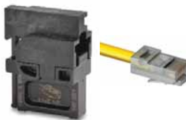
DN-CT-D8 (4300-3144) 8-pin Modular Plugs RJ45