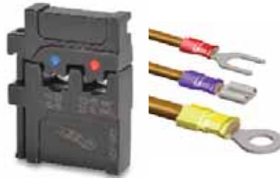
DN-CT-D2 (4300-3129) Insulated Terminals & Connectors 22–14 AWG [Red & Blue] (0.5–2.5 mm 2 )