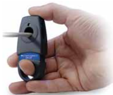
DN-CST Precision Stripping Tool [squeeze, insert cable, rotate, & remove]