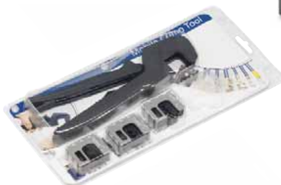
BM-5345 Crimping tool and die set