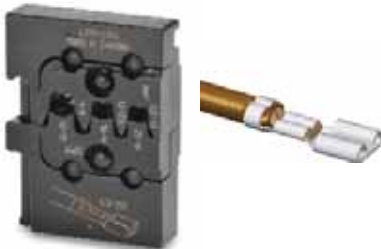
DN-CT-D7 (4300-3146) Non-Insulated Open-Barrel Terminals 22–10 AWG (0.5–6 mm 2 )