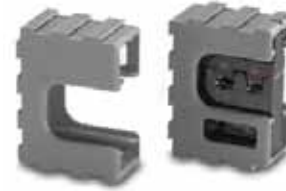
DN-CT-Dx die & holder

These dies are held together for easy handling, and can be interchanged without additional tools. All DN-CT-Dx dies have been tested on leading brands of connectors to ensure quality connections. Dies come in modular holders that can be connected together when not in use.