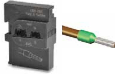
DN-CT-D5 (4300-3153) Wire Ferrules 6–4 AWG (16–25 mm 2 )