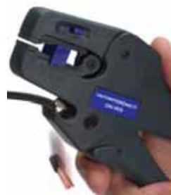
DN-WS wire cutting