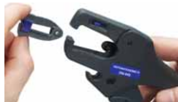
DN-WS stripping blade replacement