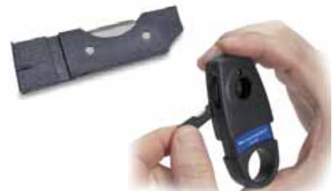
Precision Stripping Tool Easily replaceable blade