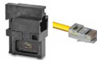
DN-CT-D9 (4300-3132) 6-pin Modular Plugs RJ11/RJ12