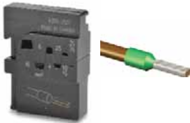
DN-CT-D4 (4300-3127) Wire Ferrules 24–8 AWG (0.25–10 mm 2 )