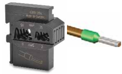
DN-CT-D6 (4300-3154) Wire Ferrules 2–1/0 AWG (35–50 mm 2 )