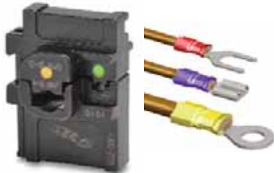
DN-CT-D1 (4300-3128) Insulated Terminals & Connectors 26–22 AWG & 12–10 AWG [Green & Yellow] (0.1–0.4 & 4–6 mm 2 )