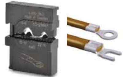
DN-CT-D3 (4300-3142) Non-Insulated Terminals & Connectors 22–10 AWG (0.5–6 mm 2 )