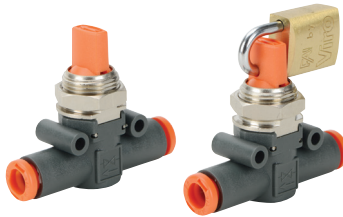
Inline Manual Shutoff Valves from $11.25