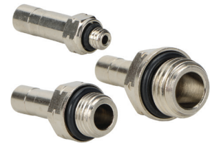
Stem Adapters from $3.25