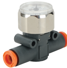
Inline Pressure Gauges from $17.75