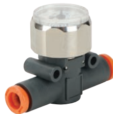
INLINE PRESSURE GAUGES from $17.75