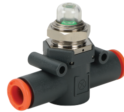
Inline Pressure Indicators from $11.75