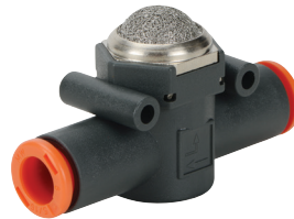
Inline Quick Exhaust Valves from $8.75