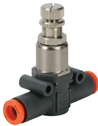
Inline Pressure Regulators from $20.25