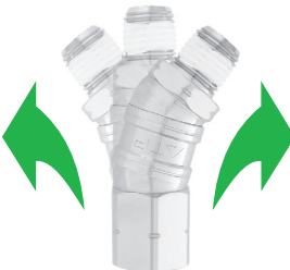
45° Swivel Design