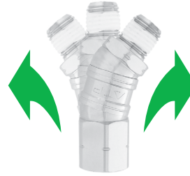
45° Swivel Design