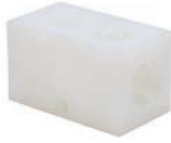
Part No. MRN-2CB