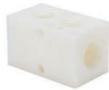
Part No. MRN-2DC