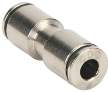
Part No. US532-B

NITRA pneumatic push-to-connect union straight fittings with nickel-plated brass body and stainless steel tube gripping claws. For use with flexible tubing. Five fittings per package.