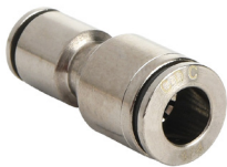
Part No. UR14-532-B

NITRA pneumatic push-to-connect union straight reducer fittings with nickel-plated brass body and stainless steel tube gripping claws. For use with flexible tubing. Five fittings per package.