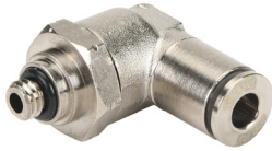
Part No. ME532-10N-B

NITRA pneumatic push-to-connect male elbow fittings with rotating nickel-plated brass body, nickel-plated brass threads, stainless steel tube gripping claws and pre-applied Teflon thread sealant (#10-32, M5 and G threads have O-ring instead of thread sealant). For use with flexible tubing. Five fittings per package.