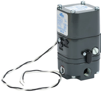
Part No. NCP1-20-315N