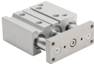
Part No. E32M050MD-M