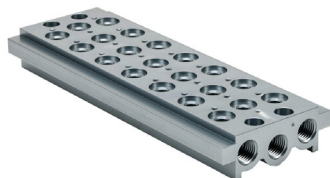
Part No. 0223000701U