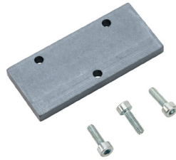
Part No. 0226004500