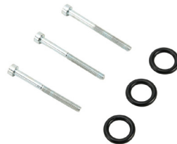
Part No. 0226004701