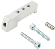
Part No. 0226004600