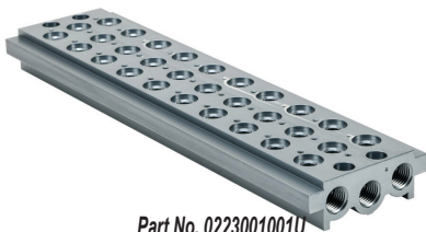
Part No. 0223001001U

Metal Work Series 70 valve manifolds are an excellent choice for installing several Series 70 air pilot or solenoid valves in a pneumatic system.