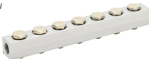
Part No. 0221000700U