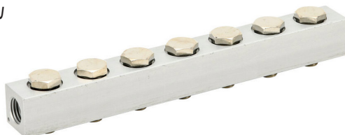
Part No. 0221000700U