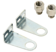
Part No. 0222000191U