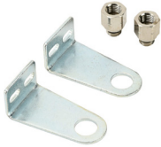
Part No. 0221000191U

Metal Work series 70 compact valve manifold accessories; for use on Series 70 air pilot or solenoid valves.