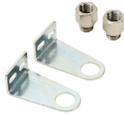
Part No. 0222000191U