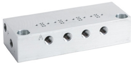
Part No. 103310092041005