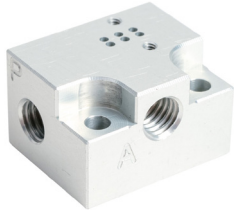
Part No. 103310081010001

The MVDY manifolds and accessories are designed to work specifically with the MVDY miniature solenoid valves. They are made of aluminum and have a maximum operating pressure of 145 psi.