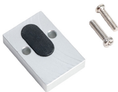
Part No. 103310091000001