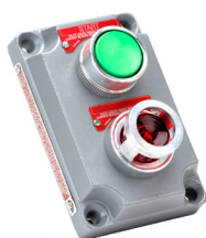
Pilot Light / Pushbutton