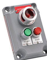
Pilot Light / Two Mini Pushbutton