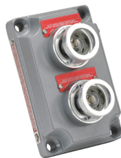
Double Pilot Light