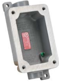
FXB-5 Feed Through