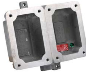
FXB-8 Double Gang Dead End