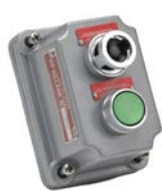
Pilot Light / Pushbutton