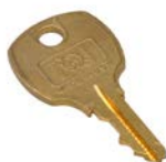
KEY-C002B Replacement Key