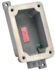
FXB-2 Dead End