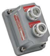
Double Pilot Light