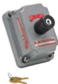
Key-Operated Selector Switch