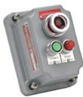
Pilot Light / Two Mini Pushbutton