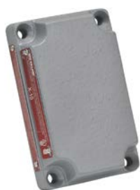
X-10 Blank Cover