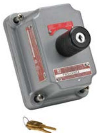
Key-Operated Selector Switch