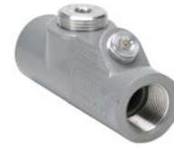
ENY-2 Sealing Fitting

The purpose of seals in a Class I hazardous location is to minimize the passage of gases and vapors and prevent the passage of flames from one electrical installation to another through the conduit system. Consult the electrical code or your local inspector for more detailed information.