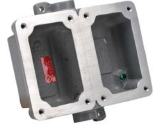
FXB-11 Double Gang Feed Through