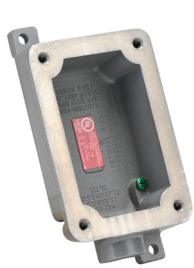
FXB-2 Dead End