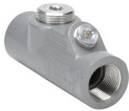
ENY-2 Sealing Fitting

The purpose of seals in a Class I hazardous location is to minimize the passage of gases and vapors and prevent the passage of flames from one electrical installation to another through the conduit system. Consult the electrical code or your local inspector for more detailed information.