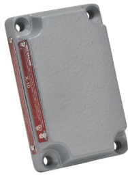
X-10 Blank Cover