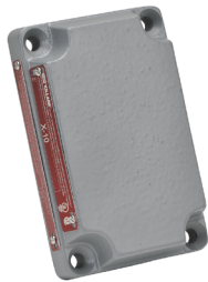
X-10 Blank Cover