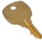
KEY-C002B Replacement Key