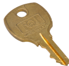
KEY-C002B Replacement Key